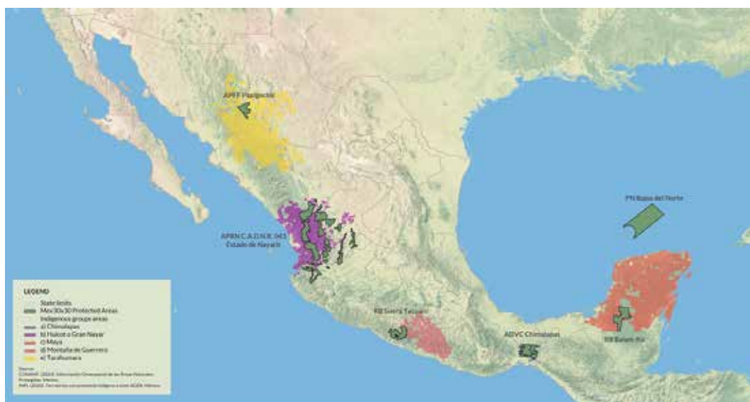
Map: MEx30x30 intervention areas.

The MEx30x30 project was approved by the GBFF Council on June 19th, 2024. Its implementation is expected to begin in 2025.